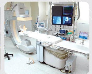
• Hospital & Medical Equipment