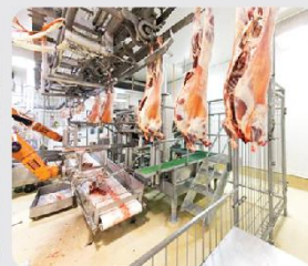
• Food Industrial