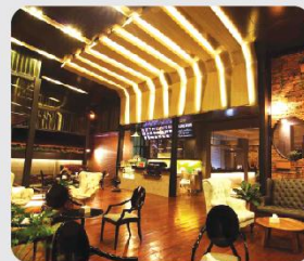
• Hotel & Resort