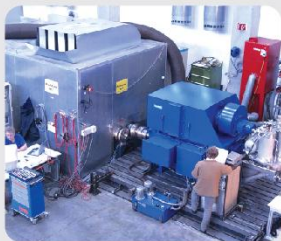
• Industrial & Manufacturer