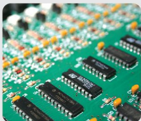
• Electronic Industrial