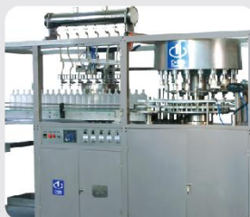
• Auto Machine