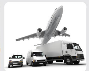
• Logistic & Transportation