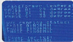
Running Status Checking