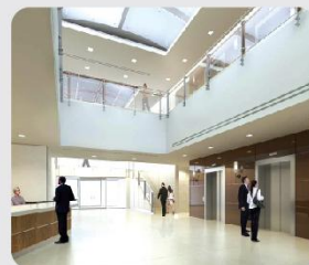
• Office Building