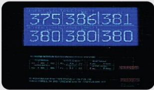
3 Phases Voltage Display