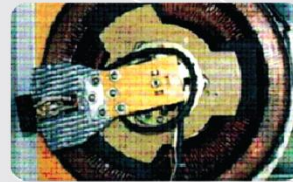
Voltage Regulating Tranformer