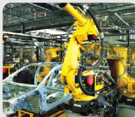
• Auto-mobile Industrial